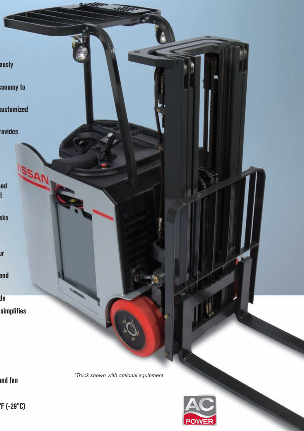
*Truck shown with optional equipment