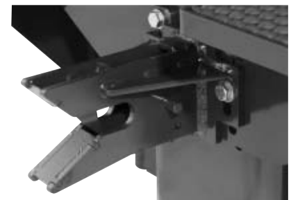
Standard jaw coupler has a robust design for secure towing. Its foot-operated release is conveniently located inside the operator compartment.