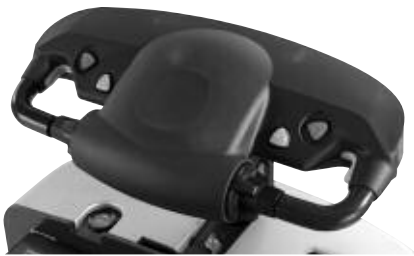
Steerhead includes two butterfly controls allowing thumb or fingertip actuation of travel and direction.

*Compartment dimensions shown without battery gates. (31" x 13.5" x 31" with gates.)