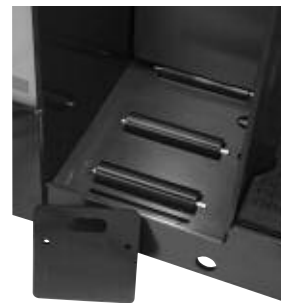
Optional battery rollers make change out quick and easy.