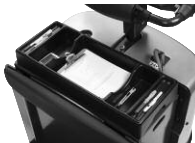
Optional convenience tray keeps operator items organized.